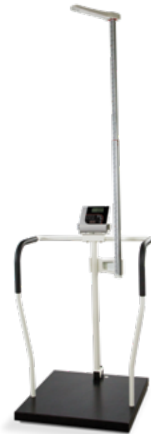
Shown with optional height rod

Dimension A includes the rear wheel in its measurement