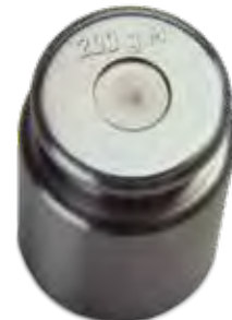
200 g M1 OIML weight PN 116203