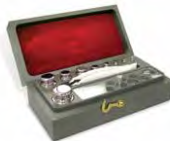
Set includes lifting device and gloves PN 30838 100 g to 1 mg