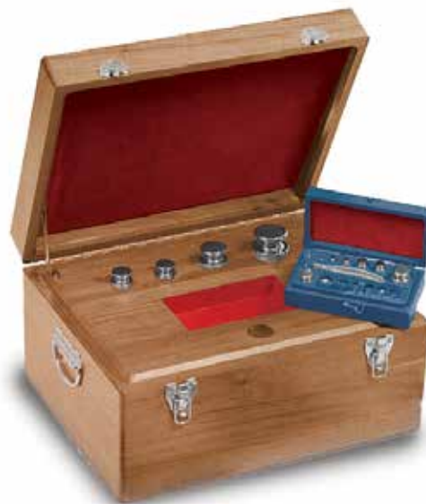
Set includes lifting device and gloves PN 30806 1 kg to 1 mg