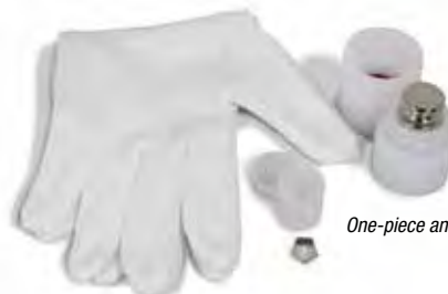
One-piece and Milligram Kits