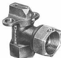
Lockwing ground key angle meter valve