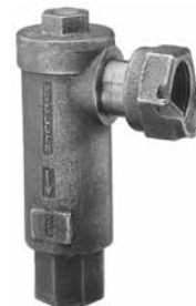
Top entry dual check valve (dual angle check also available; not shown)