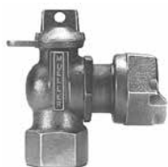
Lockwing MUELLER 300 Ball Angle Meter Valve