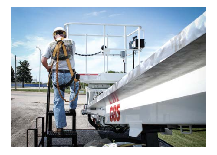
It is important to consider that buying only according to present needs may inhibit your ability to grow and take on more work in the future.

Developing the specification of your machine and ensuring you have a high-quality experience from the day you place your order to when you eventually replace your machine is important. Selecting a supplier that cares about you and is easy to work with will make your life simpler, letting you focus on your core business.