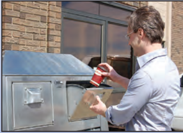
Collection chutes are intuitive and easy to use.