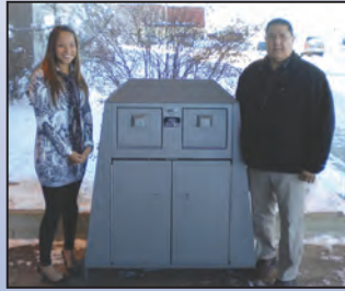
Ideal feature development.