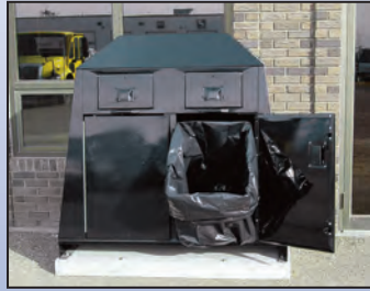
Hinged bag cages for easy servicing (poly bags available).