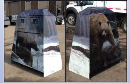
Optional Vinyl wrap looks great with zero upkeep.