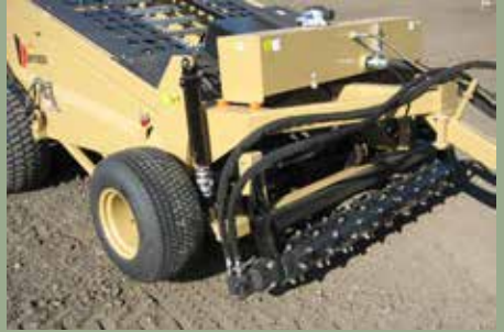
Optional Prescreening Powered Roller