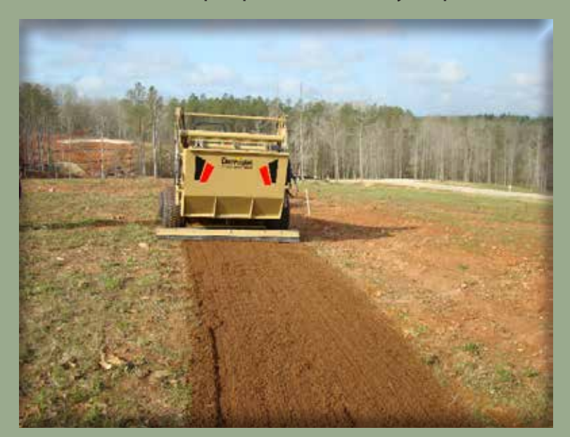
The way seedbeds were meant to be made.

PTO powered <u>all</u> hydraulic drive means dependability. No hoist or rollover chains, only 3 bearings, steel loading paddles, carbide wear points - this all means amazingly low maintenance with the quality and efficiency of a screener. No need for multiple passes - when you power-screen you get it all the first time.