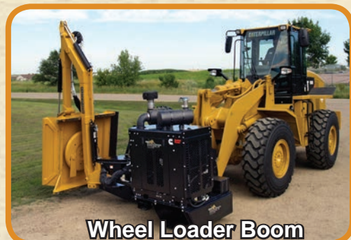
Wheel Loader Boom

Tiger Tree Shear can cut tree limbs up to 12" in diameter. Mounts to any Tiger boom.