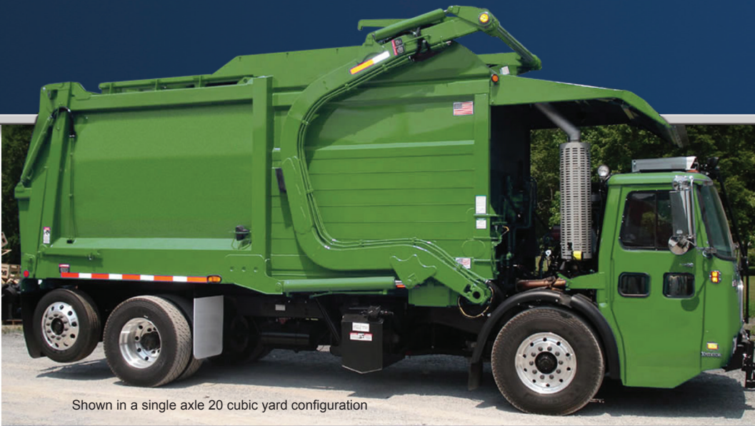
Shown in a single axle 20 cubic yard configuration