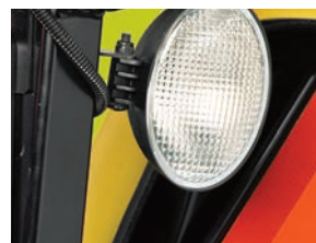
Add more visibility. LVB25547 Rear work light (1 light)