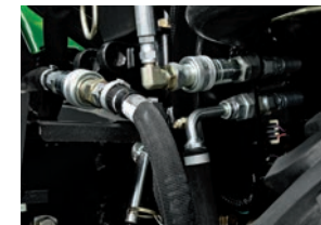
Add more force. LVB25956 Power Beyond kit