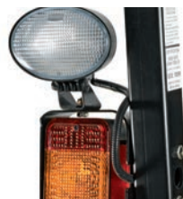
Add more hours. LVB25546 Forward lighting kit (2 lights)