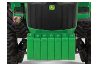
Add more stability. LVB25363 Front weight bracket