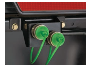
Add more control. LVB25838 3rd selective control valve (requires a Power Beyond Kit)