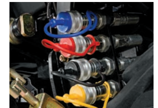
Add more productivity. LVB25837 Rear hydraulic kit