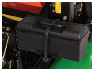
Add more convenience. LVB26110 Tool box (standard on R)