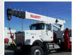
TRACTOR MOUNT BOOMTRUCKS