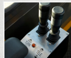
ELLIOTT DYNASMOOTH CONTROLS