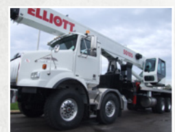
SPECIALIZED TRUCK CONFIGURATIONS