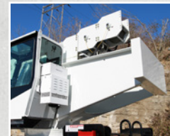
AUXILIARY WINCH PACKAGE

Visit www.elliotequip.com to find a dealer in your area for pricing, availability, rentals, financing and more. Contact Elliott directly at sales@elliotequip.com or (402) 592-4500.