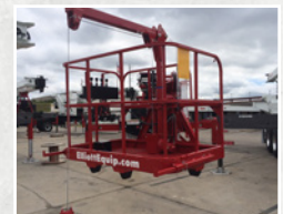
HI REACH PLATFORM & JIB WINCH