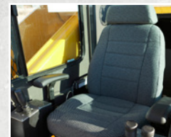
DELUXE OPERATOR CAB