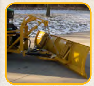
Dual Cylinders built for Angling Plow.

For additional hydraulic outlets ask about the Tiger valve multiplier kits, converts one set of tractor SCV's into 2-3-4 dual outlets. For additional features and specifications, please contact your Tiger Dealer.