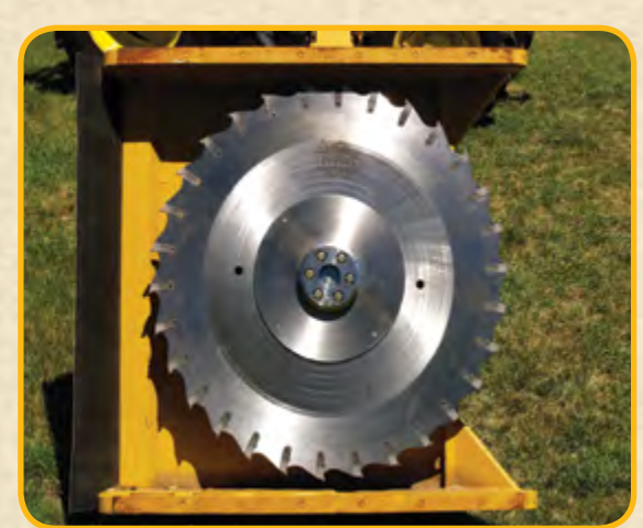
48" Saw Blade Attachment with reinforced center for added blade strength. Tiger Bengal series 50" Rotary mower shown.

The Tiger 48" Saw Blade Attachment is designed and engineered to provide a smooth cut in trees limbs. This design makes a difference to our customers when aesthetics and thrown material are a concern. The Saw Blade can be mounted on both the Bengal and Saber Series 50" Rotary Cutters. The Saw Blade comes standard with replaceable carbide tipped teeth.