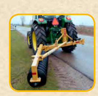
UNIVERSAL CLAW (Option)

Hydraulic toplink positions the working angle of the Claw.