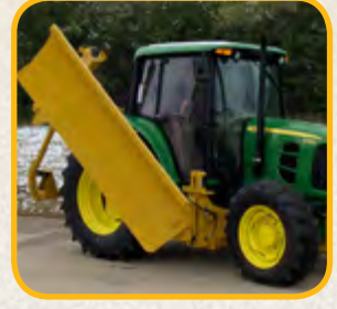
Inboard and Outboard adjustment controlled by hydraulics.