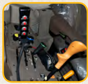
Optional -Valve Multiplier Kit