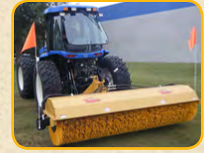
Sweepers in 10' and 12' lengths