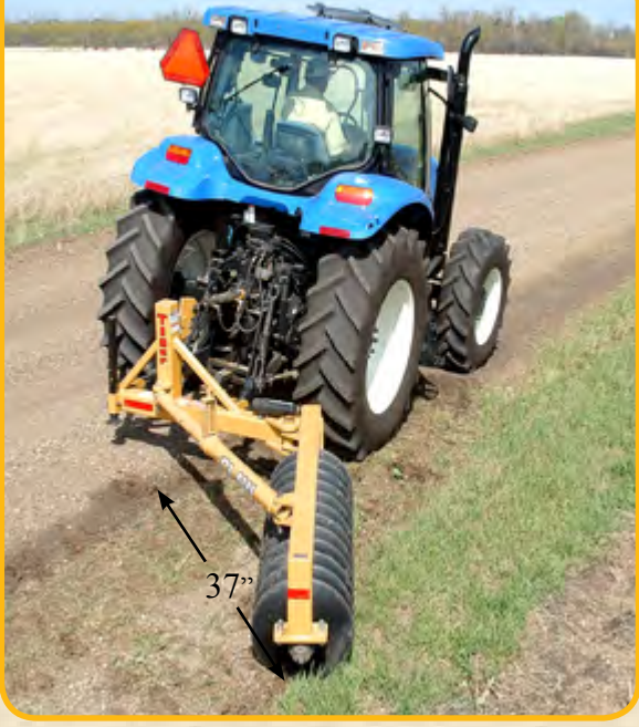
Patented angle design effectively moves and mulches 37" of mater

Designed for working on Left hand and Right hand road shoulders.