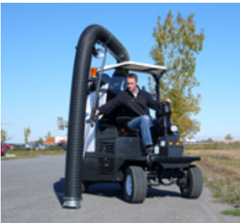
LEFT Madvac® LN50