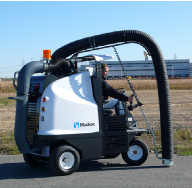
ABOVE Hydraulic arm controlled via a joystick

The Madvac® LN50 litter collector is used worldwide because: It works. It lasts. It pays for itself. Fast!