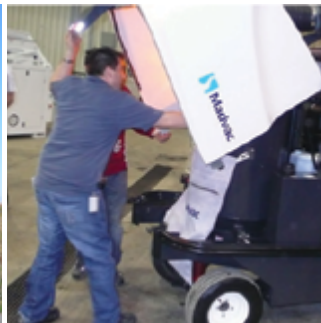
RIGHT Handle tight spots with easy access for litter removal