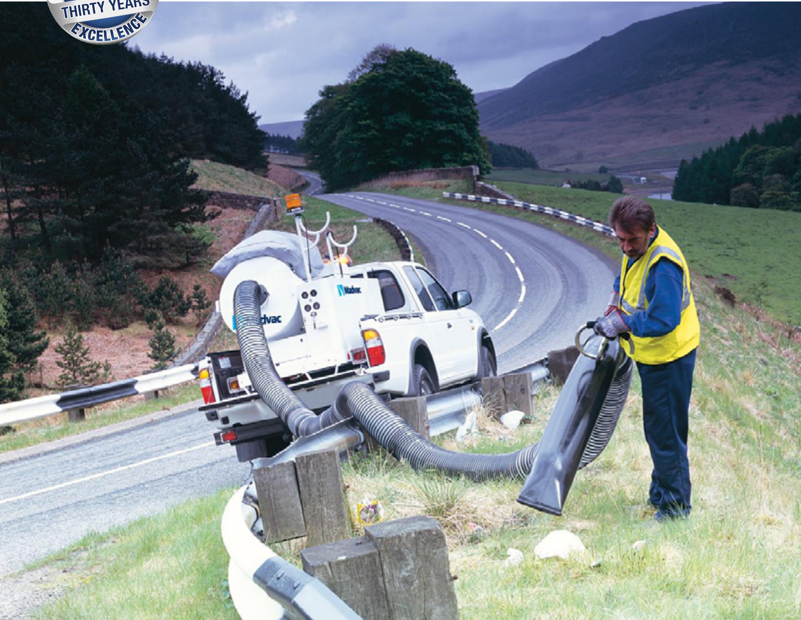
Madvac ® LP61 – Compact Portable Litter Collector