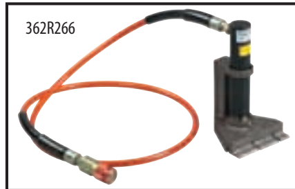
Rabbit Tool Forcible Entry Tool

Specialty Forcible Entry Tools are Ideal for Use in Urban Search and Rescue, Large Rescue Situations and Structural Collapse