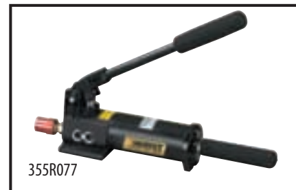
Manual Hand Pump