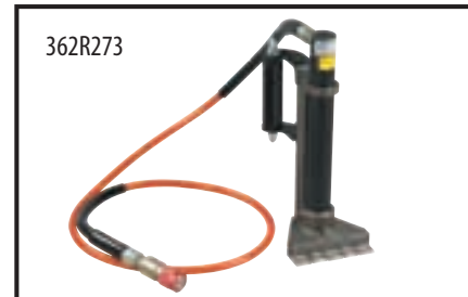
JL-8 Jack Rabbit Forcible Entry Device