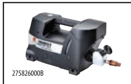
P 600 ML Single Acting (Includes 2 batteries & 1 charger)