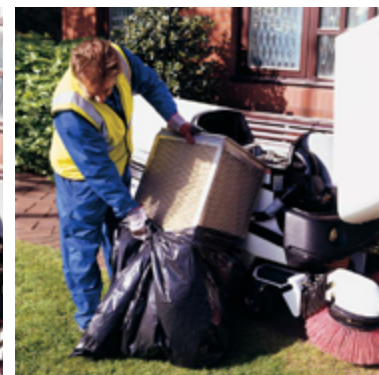
Optional hydraulic side dump "tilting".