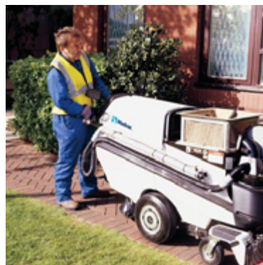
Optional hydraulic side dump "lifting".