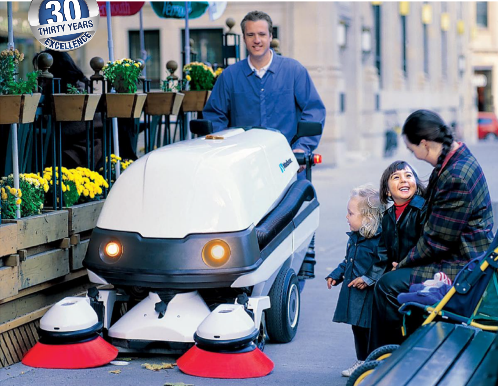
Madvac ® PS300 – Compact Pedestrian Sweeper