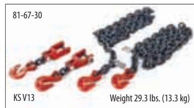
For SC 557