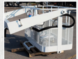
HYDRAULIC DAMPENING WORKPLATFORM