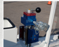
HYDRAULIC TOOL CIRCUIT WITH INTENSIFIER