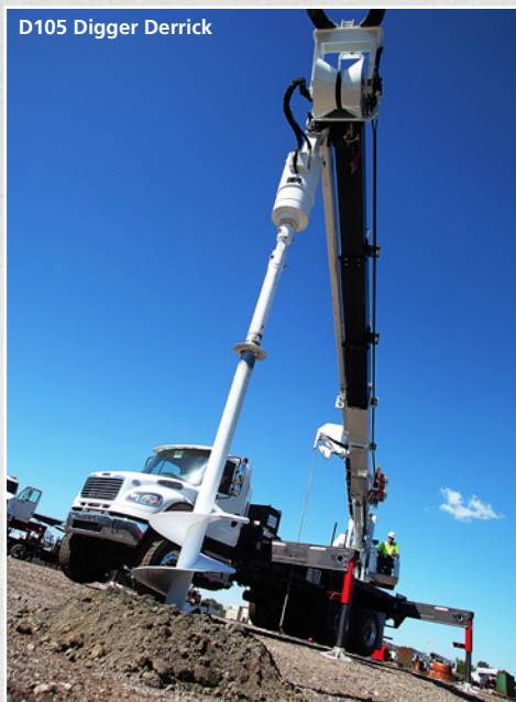
D105 Digger Derrick