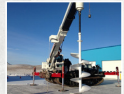
DIGGER WITH HIGH TORQUE 20,000 FT./LB. DRIVE