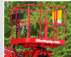
HYDRAULIC SELF-LEVELING WORKPLATFORM