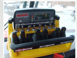
WIRELESS REMOTES WITH LMI/ WORK ENVELOPE DISPLAY