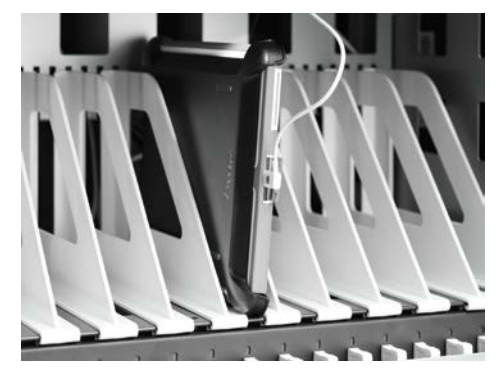
Dividers can be easily reconfigured on-the-fly to accommodate a variety of wider cases.