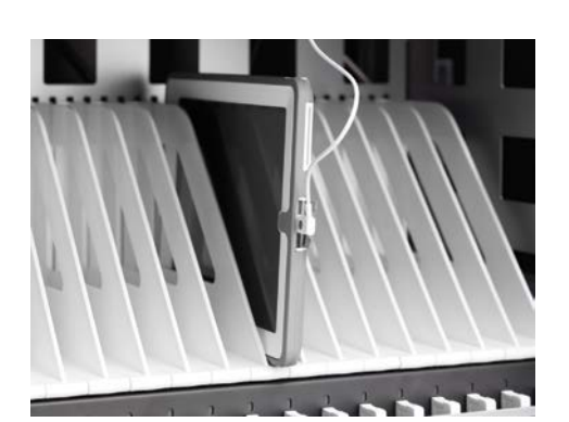
Out-of-the-box configuration holds 40 devices with or without case.