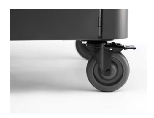
Heavy-duty plate casters have been tested to withstand 10,000 cycles over a threshold to ensure durability.