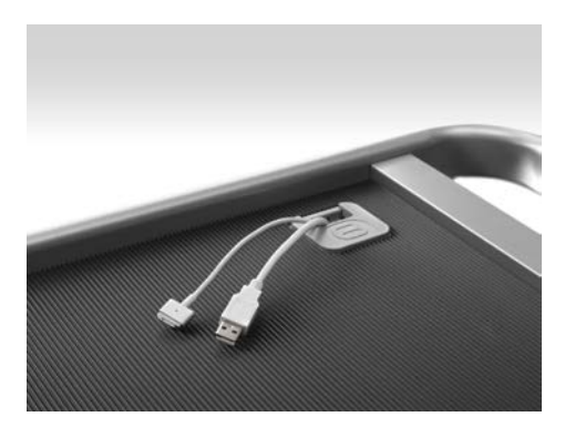
Cable grommet provides convenient access to power and USB cables for your host Mac.