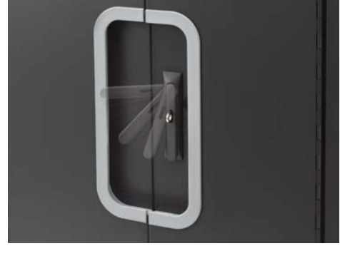
All steel door construction with three-point locking mechanism and reinforced swing handle for enhanced security.