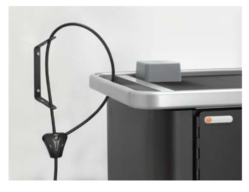
Wall-mountable locking system keeps cart secured in a room.