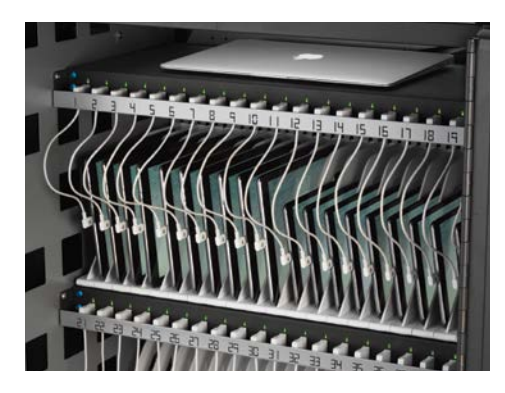
Courtesy shelf is designed to store host Mac or additional accessories.