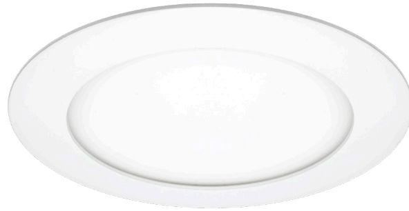
6" Brio Disc - Round BR6-30-RD (3000K / 925Lm / 12W) BR6H-30-RD (3000K / 1100Lm / 15W)