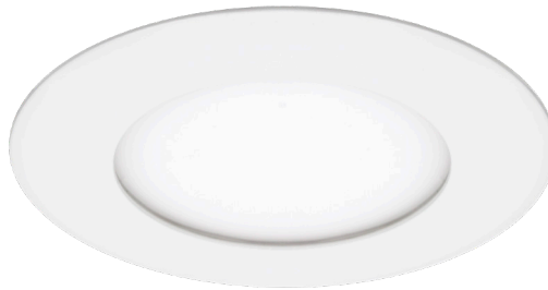
4" Brio Disc - Round BR4-30-RD (3000K / 525Lm / 9W)