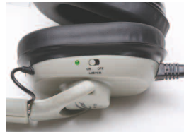
85dB switch is built into the earcups