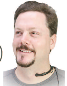
NM319 Neck Mic

The M319 transmits wireless audio to all of these Califone PA Systems