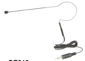
OE319 Over Ear mic