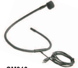
CM319 Collar Mic