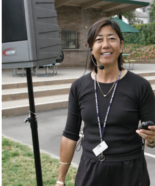
The M319 works with these five hands-free mics

The M319 can be used with any of the mics shown on this page. For use in outdoor settings, Califone recommends the Neck Mic (shown far right). Wrapping comfortably around the throat, the NM319 picks up sound vibrations from the vocal cords, eliminating disruptive wind noises or other factors which can adversely affect the quality of the audio.