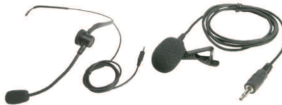
HBM319 Headset Mic