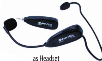
as Headset (shown with receiver)

Works as a headset mic -OR- handheld mic!