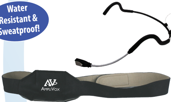
S1648T Fitness Package w/Transmitter S1648 Fitness Package

Specifically designed for the demanding needs of the fitness industry and active professionals, our Fitness Package and Waterproof Fitness Package are everything you need to Amplify your voice safely and easily, to train, teach, and speak to large groups or classes!