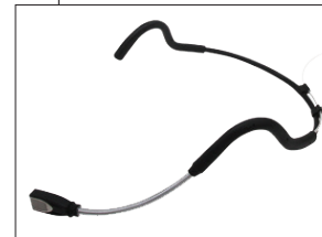
Includes waistband case and headset (transmitter included in S1648T only)