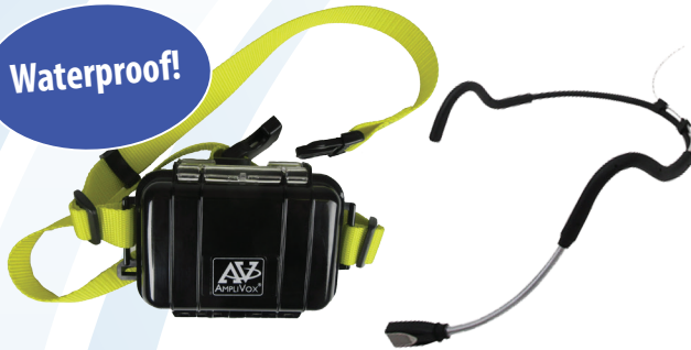
S1647T Waterproof Fitness Package w/Transmitter S1647 Waterproof Fitness Package