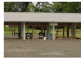
Loud enough for a firing range