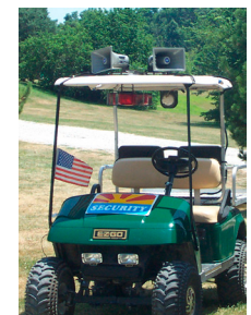
For Golf Carts

SOUND CRUISER Twin horns with car-top mounting assembly: non-marring vacuum cups and gutter hooks. S805A 50-watt multimedia stereo amplifier, S2080 cardioid dynamic handheld mic with 5-ft coil cord; DC car adapter and cables included.