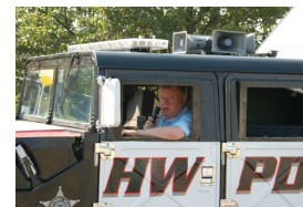
For Car Tops