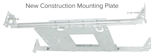
New Construction Mounting Plate