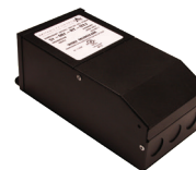
24V AC Magnetic Transformer NEMA 3R enclosure, cETLus Listed for outdoor use TR-150-24 (60-150W capacity) TR-600-24 (240-600W capacity) TR-900-24 (360-900W capacity)