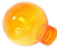
Replacement Festoon Globe 2-3/8" polycarbonate LFS-GLOBE-CL (Clear) LFS-GLOBE-BL (Blue) LFS-GLOBE-PI (Pink) LFS-GLOBE-PU (Purple) LFS-GLOBE-RE (Red) LFS-GLOBE-YE (Yellow)