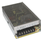
12V DC Regulated Power Supply Requires waterproof enclosure LED-DR50-12-LU (50W driver) LED-DR100-12-LU (100W driver) LED-DR150-12-LU (150W driver)