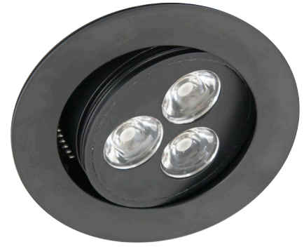
LMS-3 Swivel - Black 3.75W / 185Lm