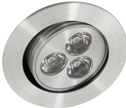
LMS-3 Swivel - Satin Aluminum 3.75W / 185Lm