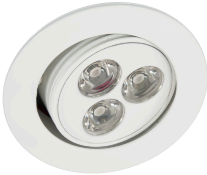
LMS-3 Swivel - White 3.75W / 185Lm