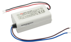
350mA 16W Hardwire Driver 100-240V AC input / Class 2 cURus / Non-dimming (1-3 fixtures)