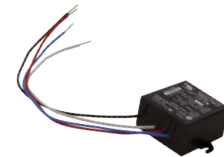
350mA 6W Hardwire Driver 100-277V AC input / Class 2 cURus / Non-dimming (1 fixture)