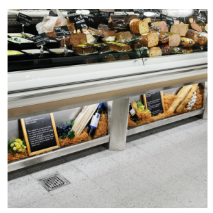
Selected references Dubai Mall, IKEA, Tesco, Coop, Metro, Carrefour, Lidl, Woolworths. Reference list available on request.