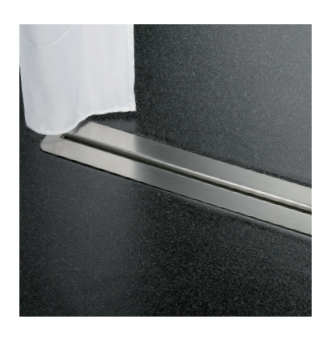
Selected references Queen Mary Hospital (Portmouth), Hvidovre hospital (DK), Blackpool Victoria Hospital, Queen Elizabeth Hospital (Hong Kong), St. James Hospital (Leeds), University College London Hospital. Reference list available on request.

The patented BLÜCHER® water trap is self-cleaning and easily removed to facilitate direct access for rodding. Also a water trap variant that actively prevent the spreading of fire through the piping system is available.