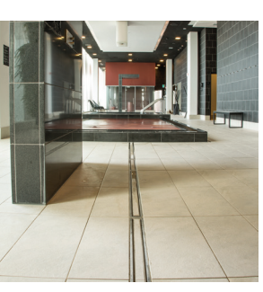
Selected references Sportcentrum Fitness First (the Hague), Czàszar Swimming Pool (Budapest), Sports & Aquatic Centre (Melbourne). Reference list available on request.