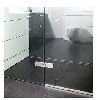
Selected references Hilton Hotels, Hotel Marriot, Sofitel, Novotel, The Ritz Carlton (Bahrain), Hotel Bella Sky (Copenhagen). Reference list available on request.