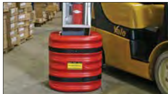
Model 172412 RED 12 in. (30.5 cm.) Column Protector / 24 in. x 24 in. x 24 in. (61 cm. x 61 cm. x 61 cm.)