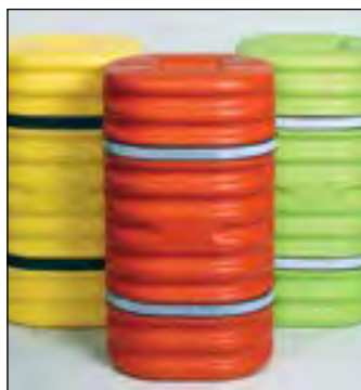
Model 1712 Model 1712OR Model 1712LM