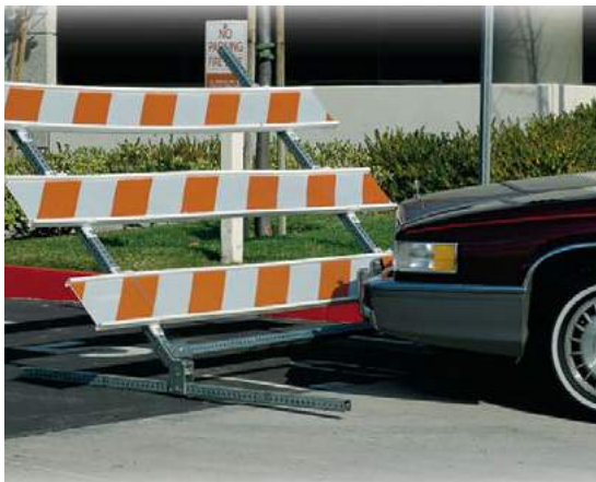
A Tie-Bar is used for added support and rigidity.

TrafFix Breakaway Type III Barricade utilizes the all-plastic Phoenix Rail and uses Unistrut® Telespar tubing with breakaway base, bracket and detachable feet.