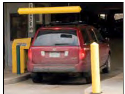
Model 1781 Clearance Bar / in: 7 in. dia. x 77 in. L cm: 17 x 195.6