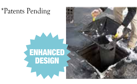
ENPAC's enhanced design has increased the surface area for greater sediment retention.