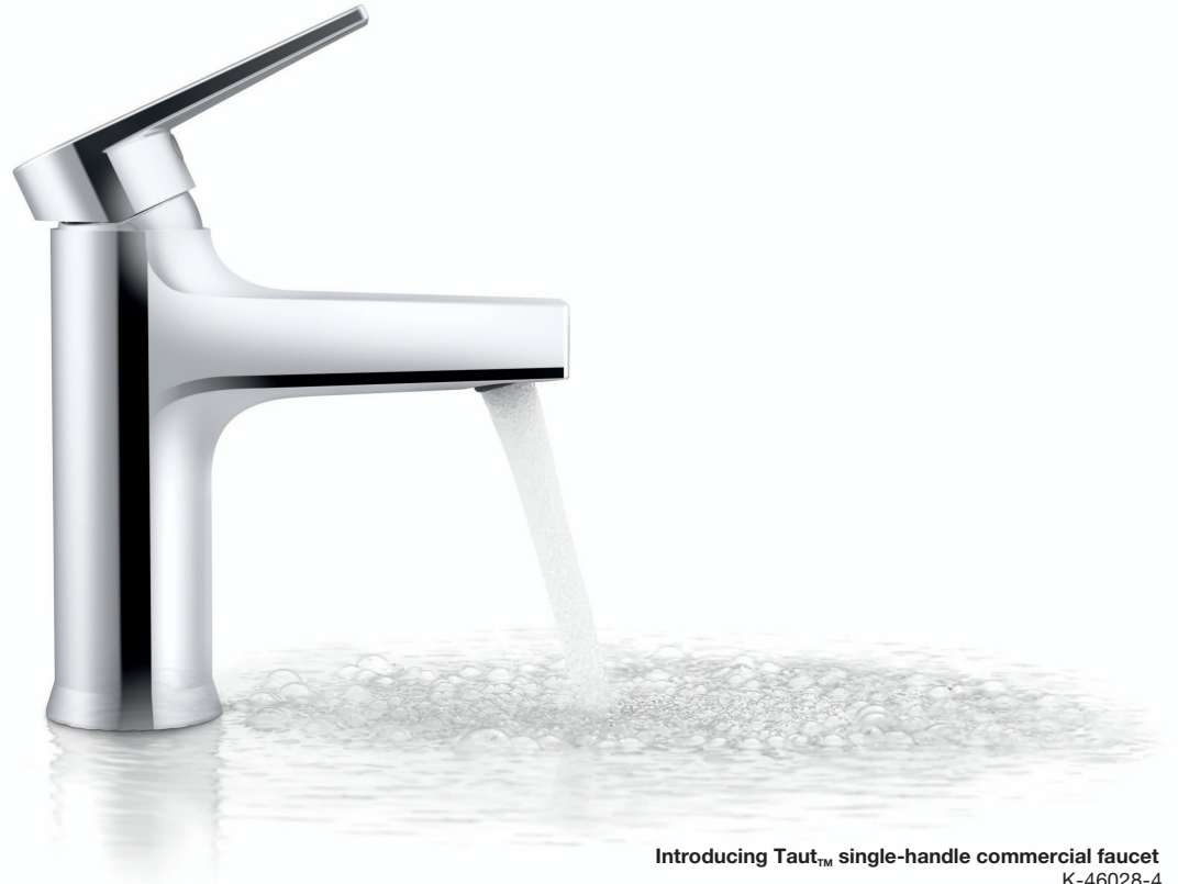
Introducing Taut™ single-handle commercial faucet K-46028-4