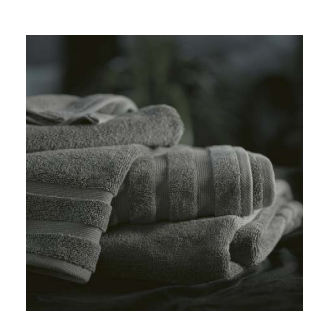
Thunder™ Grey A deep gray makes a statement in traditional, contemporary or transitional settings.