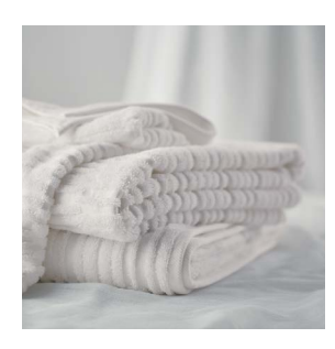
White Clean and crisp, it is a perfect fit for any style.