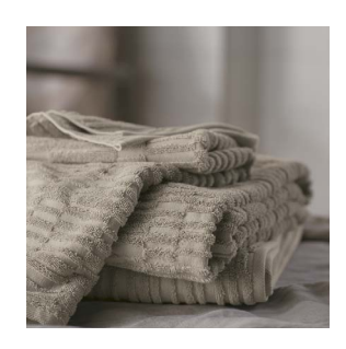
Truffle Quiet, yet compelling, it adds depth to the room.