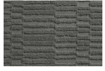
Textured A waffle weave offers luscious texture with extra-long staple cotton for optimal absorbency.