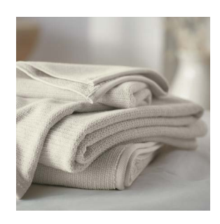
Dune A subtle, neutral shade that lends a calm, soothing feel to any space.