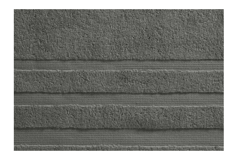
Terry Woven with long, thick terry cloth loops with a rich 700-gram weight that creates a luxurious drape.

KOHLER<sub>®</sub> Turkish Bath Linens are crafted in Turkey and are offered in three classic patterns: Terry, Textured and Tatami. The Tatami pattern comes from the woven straw mats sometimes used as floor covering in traditional Japanese design. This towel pattern is only available from Kohler.