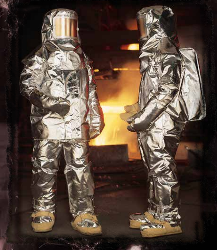
Left, the 700 Series Proximity Suit, featuring a coat and pants. Right the 705 Series Proximity Coverall.

akeland's 700 and 705 Series Proximity Suits are designed for performance of maintenance and repairs in high heat areas. Workers wearing these proximity garments are insulated form harm by Lakeland's unique, proven multi layer construction, with the outer layer composed of high temperature Aluminized Fiberglass. An additional moisture/steam barrier lining provides protection in areas where exposure to hot liquids, steam, or hot vapor is a possibility. Redesigned for better fit, the 700 and 705 Series Suits are available in coverall