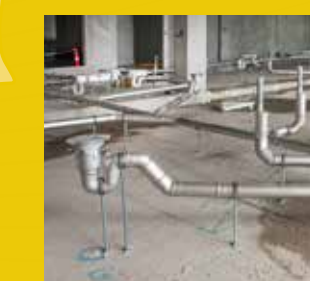
BLÜCHER® EuroPipe Complete push-fit pipework system OD40-315 mm for above- and below-ground installation. Designed for top hygiene. Hardly any maintenance required.