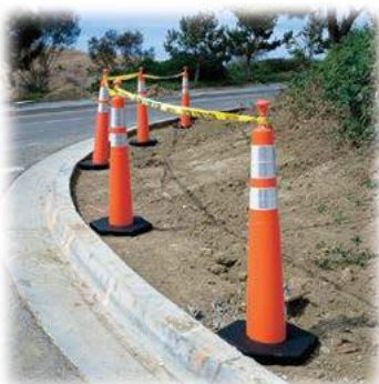
Grabber-Cone 42" with caution tape wrapped around handle

The composite construction offers strength and durability. Bases are made from 100% recycled rubber. (Weight 10, 16 or 30 lbs.)