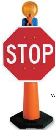
Grabber-Cone 42" with stop sign and warning light