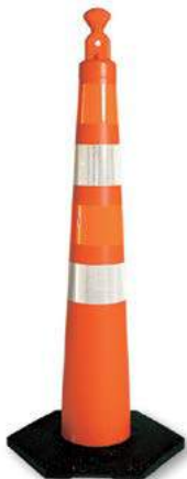
Gabber-Cone with 4" bands 42244-CRU-16HIP

With its reinforced handle design, The Grabber-Cone can support the weight of stacked cones and bases without permanent distortion. Its low density polyethylene material and handle design prevents the cones from sticking together when stacked. The Grabber-Cone can be stacked with or without bases.