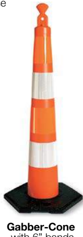
Gabber-Cone with 6" bands 42266-CRU-16HIP