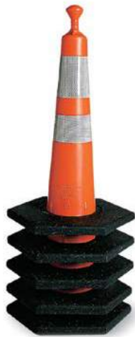
Grabber-Cone 28" with recycled rubber base