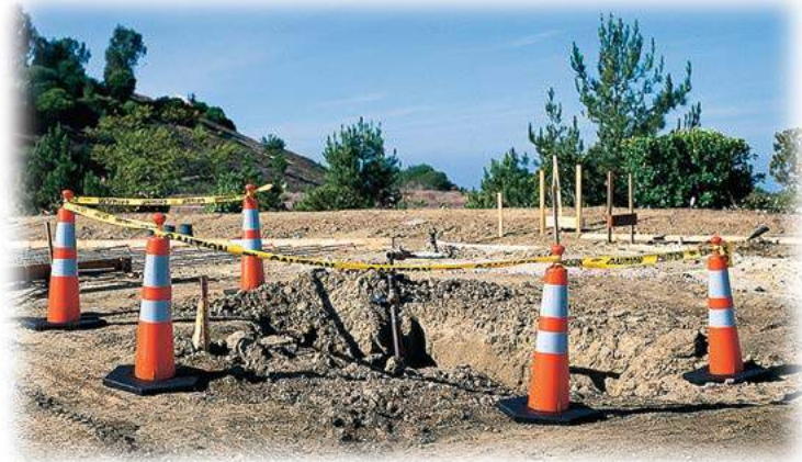
28" Grabber-Cones with caution tape provide an ideal way to protect hazardous off-road areas

Grabber-Cones come in 28" and 42" heights and are ballasted by 10, 16 or 30 lb. bases. Simply drop the recycled rubber base over the cone stem and you're ready to go to work.