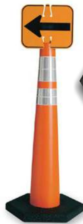
42" Grabber-Cone with directional arrow sign