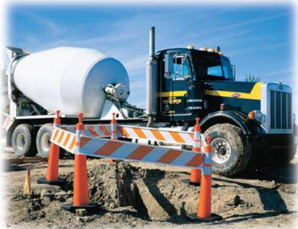
Grabber-Cone 42" and plastic rails can define hazards and construction work areas