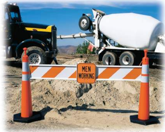
Grabber-Cone 42" as a linkable barricade with interchangeable signs