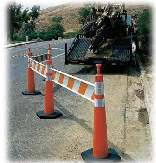
Channelize traffic with 42" Grabber-Cone and optional plastic barricade panels