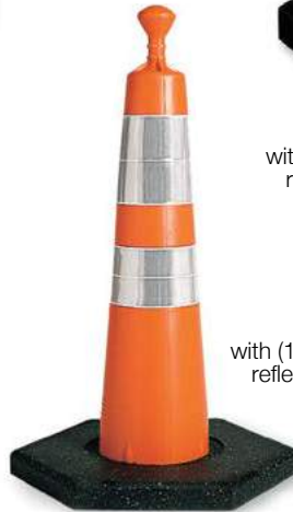
Grabber-Cone 28" with (1) 4" and (1) 6" band of white reflective sheeting and a 10 lb. recycled rubber base 28164-CRU-10HIP

The composite construction offers strength and durability. Bases are made from 100% recycled rubber. (Weight 10, 16 or 30 lbs.)