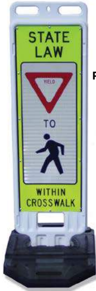
TrafFix Vertical Panel Barricade 12" x 36" with 28 lb. recycled rubber base. "State Law Yield to Pedestrians Within Crosswalk" meets MUTCD Standard 33236-LDWH28-SLY