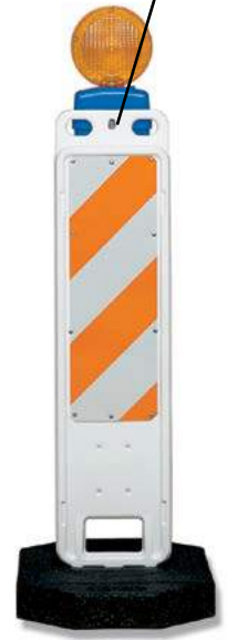
34000 Series 8" x 24" Traffix Vertical Panel Barricade with light and 43 lb. recycled rubber base

The panel separates from the base when impacted by a vehicle.