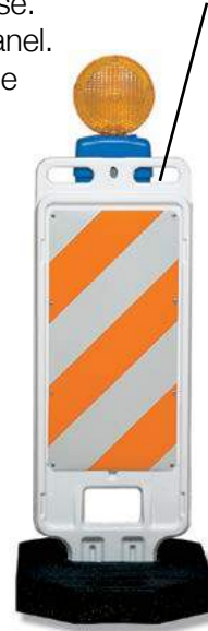
33000 Series 12" x 24" Traffix Vertical Panel Barricade with light and 43 lb. recycled rubber base