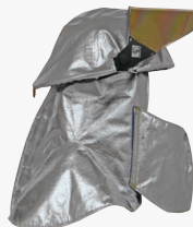
Optional J-Fire shroud

Models HT-BF2-PROX and HT-LF2 PROX also available. Both models have Crosstech® moisture barrier.