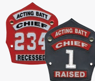
Acting Batt Chief (recessed or raised)