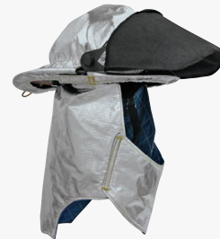
Optional faceshield cover