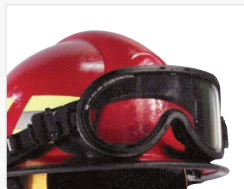
Optional Paulson or ESS NFPA 1971 goggles