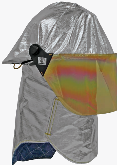
Standard Lite Force LR Low Rider HT-LFL-PROX