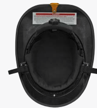
Optional one-piece brow comfort cap