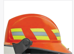
6 parallelograms Reflexite® lime or 3M™ Scotchlite™ lime or orange, 2-tone lime or orange