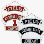
FDNY Field Comm Unit