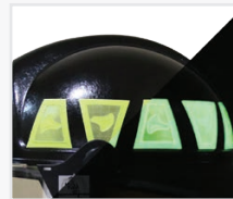
Optional 10 - trapezoids Foxfire™ illuminating trapezoids