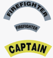
3M™ Scotchlite™ garment-style arched title tapes