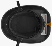
One-piece leather brow comfort cap and ratchet cover