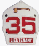
FDNY Assigned Officer