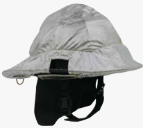
Aluminized Pbi cover – recommended for live fire training – not for proximity firefighting