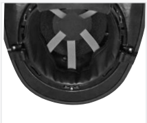
Low Rider leather headband and ratchet cover