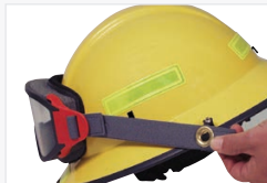
ESS 2-strap quick-attach goggles w/padding