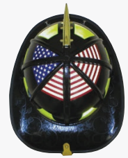
3M™ Scotchlite™ truck-style flag