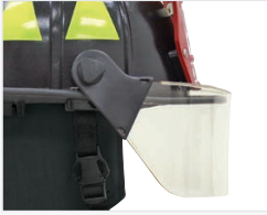
4" x .150" new generation faceshield