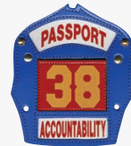
Houston Passport System