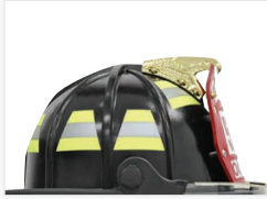
8 trapezoids 3M™ Scotchlite™ 2-tone lime or orange