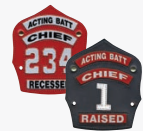
Acting Batt Chief (recessed or raised)