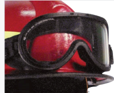
Paulson or ESS NFPA 1971 goggles