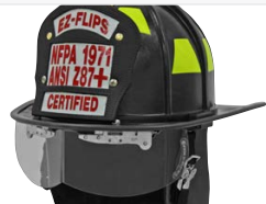
EZ-Flips (Meets standards of NFPA 1971 and ANSI Z87.1+)