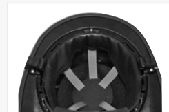
Low Rider optional leather headband and ratchet cover