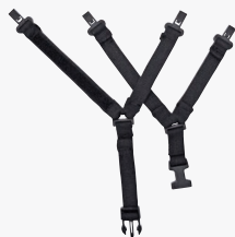
Optional Nomex® 4-point with quick-release chinstrap