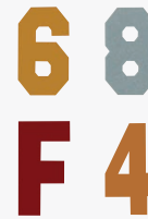
3M™ Scotchlite™ truck-style letters and numbers