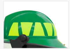
10 trapezoids Reflexite® lime or 3M™ Scotchlite™ solid lime or orange, 2-tone lime or orange