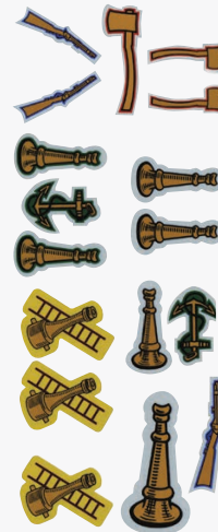
FDNY heraldic reflective insignias