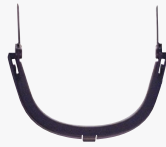
visor bracket required