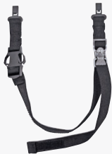
Standard Nomex® postman slide and quick-release chinstrap