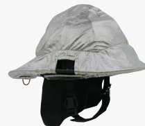
Aluminized Pbi cover – recommended only for live fire training, not for proximity firefighting