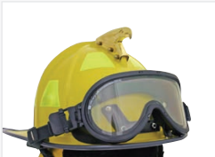
Paulson or ESS NFPA 1971 goggles