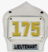
FDNY Covering Officer