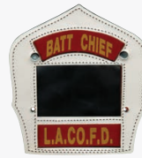
LA County Passport System