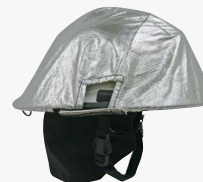
Aluminized Pbi cover - recommended for live fire training - not for Proximity firefighting