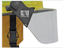
Standard 4" x .150" new generation faceshield