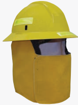
Face/neck shroud yellow Nomex® FR cotton