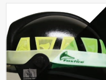
Illuminating Foxfire™ Helmet Band