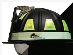
Illuminating Foxfire™ Helmet Band