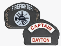
Leather passport fronts