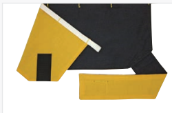
Optional Canadian-style ear cover