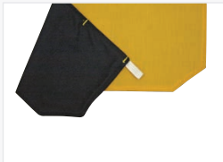
Standard BPR yellow Nomex® moisture barrier FR cotton ear cover