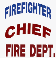
3M™ Scotchlite™ truck-style arched and straight title tapes