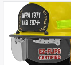
EZ-Flips (NFPA 1971 and ANSI Z87.1+)