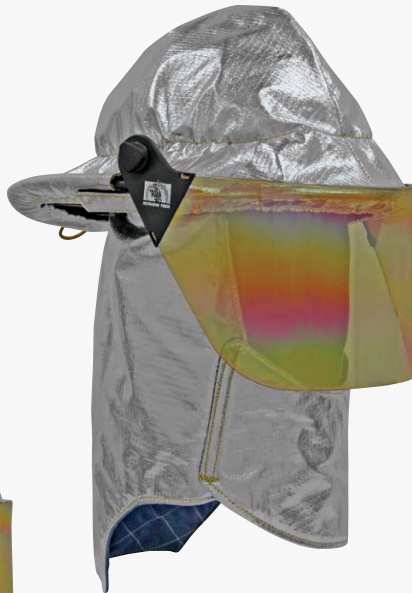
Standard Ben 2 LR Low Rider HT-BFL-PROX