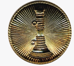
Metal circular rank insignias