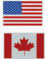
3M™ Scotchlite™ truck-style retroreflective flags