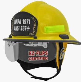
Optional EZ-Flips™ Meets standards of both NFPA 1971 and ANSI Z87.1