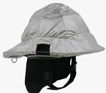
Aluminized Pbi cover – recommended for live fire training – not for Proximity firefighting