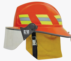
Optional 3 sets of parallelograms Reflectix® lime or 3M™ Scotchlite™ lime or orange, 2-tone lime or orange