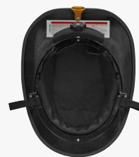
Optional one-piece leather brow comfort cap and ratchet cover