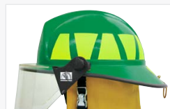
Optional 10 - trapezoids Reflectix® lime or 3M™ Scotchlite™ solid lime or orange, 2-tone lime or orange