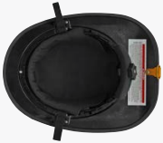
One-piece brow comfort cap