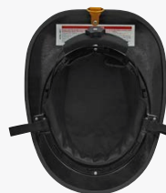
One-piece leather brow comfort cap and ratchet cover