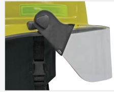
4" x 150" or 6" x 130" new generation faceshields