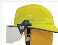
Standard 5 - 1" x 4" bars