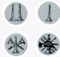
Retroreflective circular rank insignias