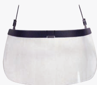
6" x .060" poly /carb visor for front and full-brim helmets