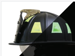
Optional 8 – trapezoids Foxfire™ illuminating trapezoids