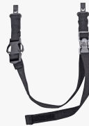
Standard Nomex® postman slide and quick-release chinstrap