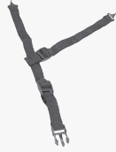
polypropylene 4-point with quick-release chinstrap