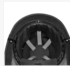
Low Rider leather headband and ratchet cover