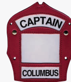
Columbus or Chicago

We can design a leather front to meet your specific needs.