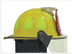
8 trapezoids 3M™ Scotchlite™ lime or orange