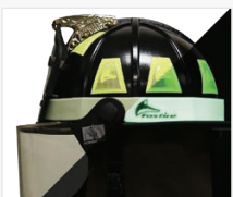
Illuminating Foxfire™ Helmet Band