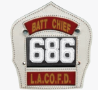
LA County Passport System