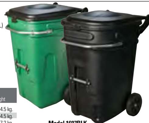
Model 1697BLK 95 Gallon (359.6 L)