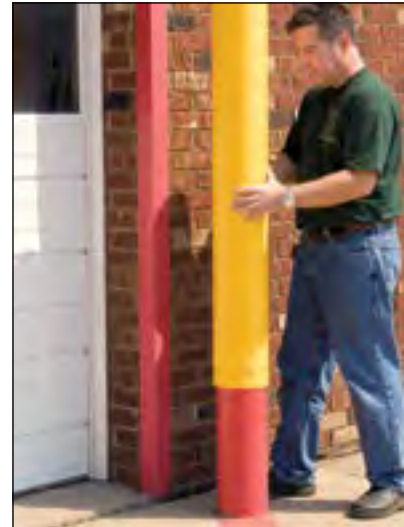
Model 1736 - 6 in. (15.2 cm.) Smooth Post Sleeve 6.875 in. x 56 in. (142.3 cm.)