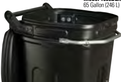
Model 1696BLK 65 Gallon (246 L)