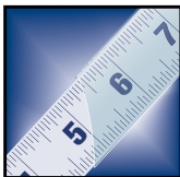
Durable Nylon Encased Blade