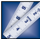
Dual-Sided White Blade