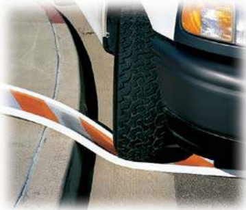
Try this with a wood or metal barricade panel