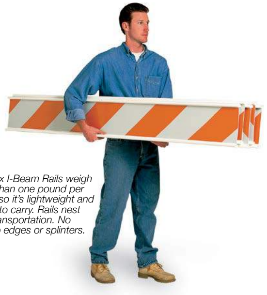
TrafFix I-Beam Rails weigh less than one pound per foot, so it's lightweight and easy to carry. Rails nest for transportation. No sharp edges or splinters.