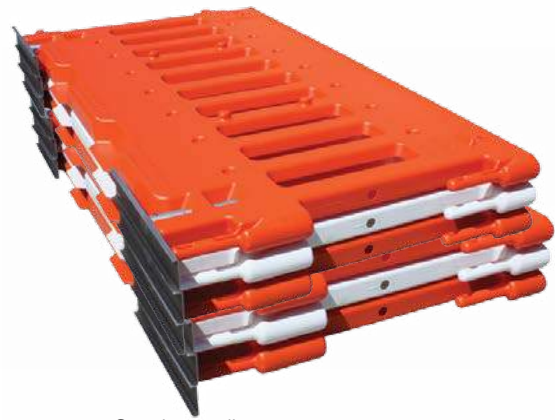
Stacks easily for transport and storage