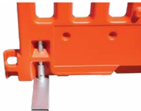
Legs out for use