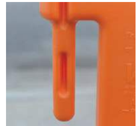
The Blow Molded Connectors Provide Strength and Security