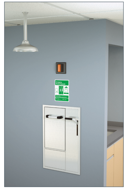
Recessed Safety Station with Drain Pan. Shown with Alarm. GBF2150, AP280-230