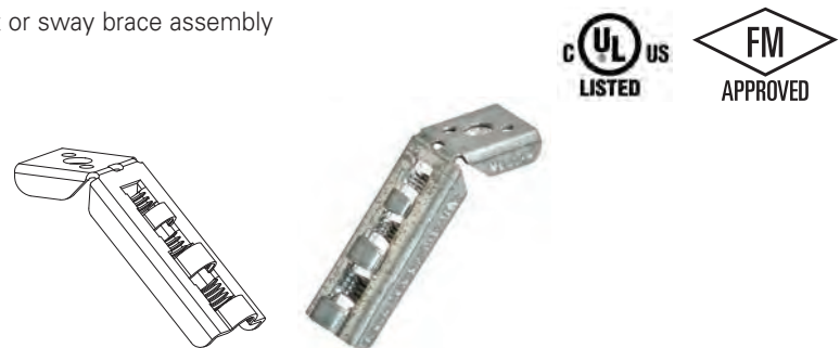
Fig. 77 - TOLCO™ Structural Attachment for Branch Line Restraint Assembly (UL Listed) Structural Attachment for Sway Brace Assembly (FM)

Refer to pages 42 for UL Listed information and sizing. Refer to pages 43 for FM information and sizing.