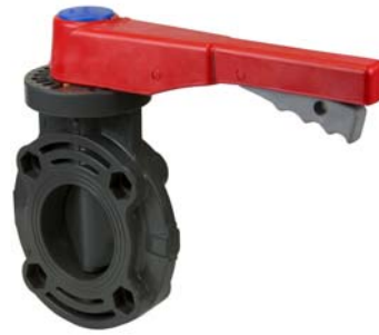
Lever Handle Style