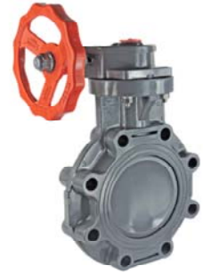
Gear Operator Style

Pressure Rating @ 73°F (23°C), Water 1-1/2" - 12" 150 psi