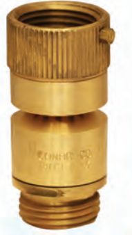
38-304-02 SIZE 3/4"