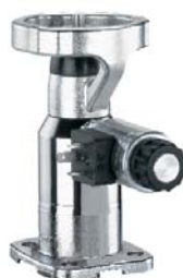
Seal adjuster/stroke limiter with electromagnetic locking device (MAG)