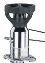
Mounting for proximity switches