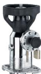
Seal adjuster/stroke limiter with manual locking device (LOC)