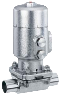
Operator size 2