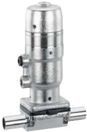
Operator size 1