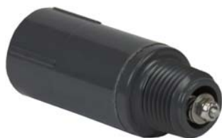
Mipt x Fipt