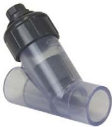
PVC Clear — Socket Style