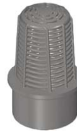
PVC Gray Spigot Or Threaded