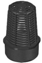
PE Black Threaded Only