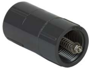
Fipt x Fipt