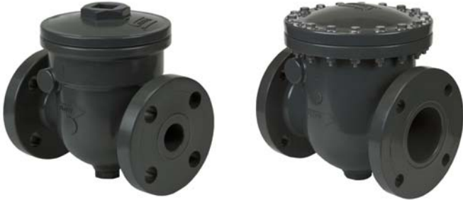
Threaded Bonnet on Sizes 3/4", 1" & Bolted Bonnet on Sizes 1-1/2" & Up 1-1/4" (Valve Shown with Arrow Indicator Option)

Pressure Rating @ 73°F (23°C), Water 3/4" - 4" 150 psi 6" 100 psi 8" 70 psi