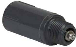
Mipt x Fipt