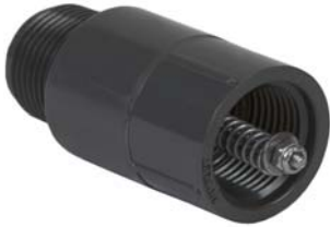
Fipt x Mipt